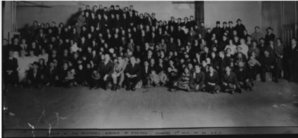
Jewish Immigrants from the SS Asia arriving in Halifax 1924

found temporary refuge in Romania. However the Romanian government had demanded that either they left voluntarily or they would be deported back to where they had come from - which meant certain death. The doors of almost every country were closed to them, and "their distress was indescribable."