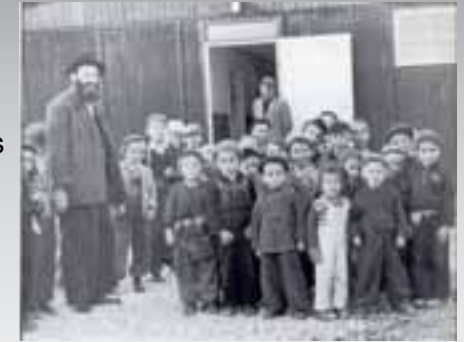
Jewish Orphans from Europe

when the admission of one thousand orphans was granted by an Order-in-Council, subject to inter alia guarantees regarding reception, placement and public charge liabilities, all of which JIAS undertook. A total of 1,116 children were brought to Canada.