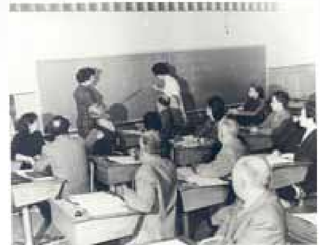
JIAS language class, Montreal 1950's