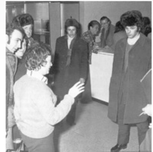
Russian Immigrants arriving in Canada

The early 1970's saw the beginning of the migration of Soviet Jews, culminating in the largest mass migration of Jews since