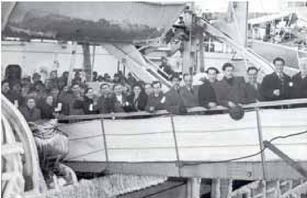
Holocaust Survivors Arriving in Halifax

A trickle of survivors was admitted when JIAS helped immigrants from displaced-persons camps in Europe to resettle across Canada. After the establishment of the State of Israel, the gates of Canada finally opened.