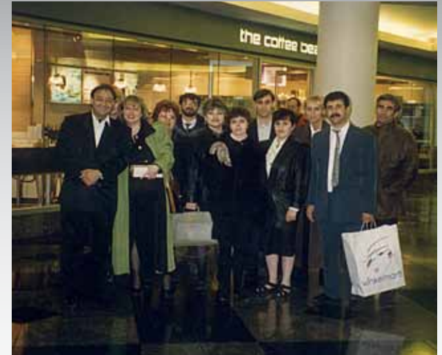
A group of new immigrants at the train station after their interview for permanent status in Canada at the Canadian Consulate in Detroit in the 1990’s

In 1992, JIAS had submitted to the immigration authorities 63 applications to sponsor some 160 Jews from Bosnia-Herzegovina as refugees for settlement in Canada. The applications were approved and refugees began arriving in fall of 1992. Twenty of those families settled in Toronto, 10 in Montreal, and the remaining families in Windsor, Hamilton,