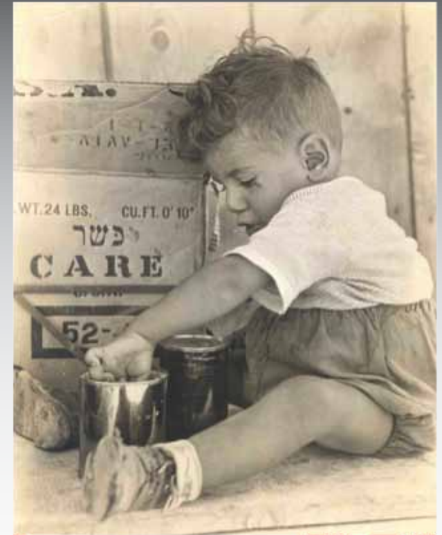
Young boy with CARE parcel August 1948

In the spring of 1953, several important changes in the admissibility of immigrants were introduced. Three categories of immigrants were established: (1) sponsored cases, (2) approved church programs and (3) open-placement cases.