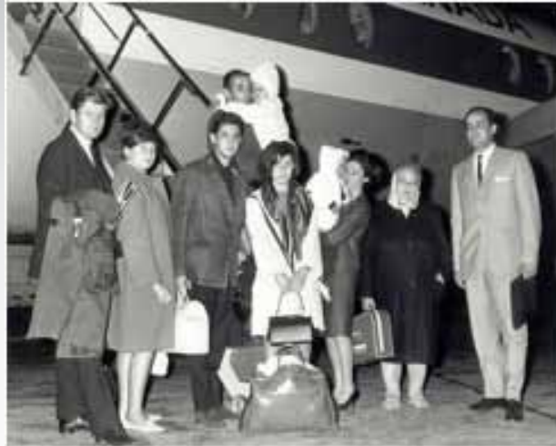
Moroccan immigrants arriving in Canada

North African Jews have immigrated to Canada through JIAS.