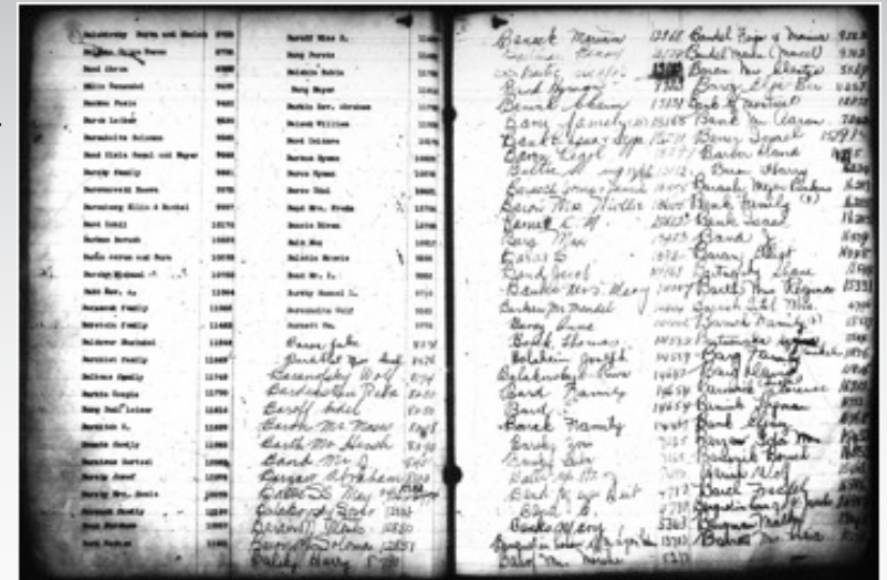
Ledger pages listing some of the earliest JIAS assisted immigrants.

deposit from each detained immigrant whose case was appealed to Ottawa, a case deposit or satisfactory guarantee from responsible