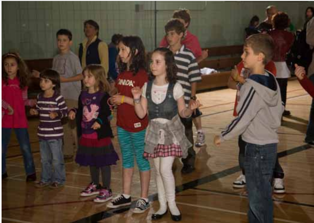
Argentine children join others at a community dance party.

True war refugees, these new members of Jewish community faced a daunting challenge. They had lost their homes and livelihoods; many had lost family and friends; and some had left behind parents and siblings in Sarajevo.