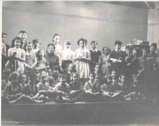
Hungarian Jewish Congregation Chanukah Party 1958. Many of the children are receiving the first Jewish education of their lives.

The revolt in Hungary in 1956 brought approximately 30,000 Hungarians to Canada, a small percentage of whom were Jewish. JIAS resettled a number of families, some of whom stayed in JIAS homes for a short while.